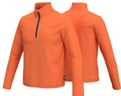
634 MARS ORANGE