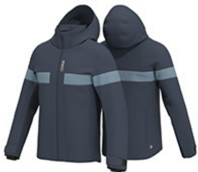
68 NAVY BLUE-AVION