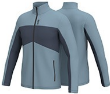
667 AVION-NAVY BLUE