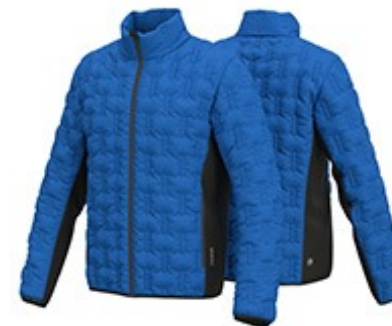
152 ABYSS BLUE-BLACK