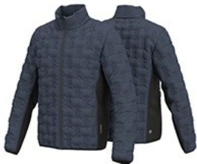
68 NAVY BLUE-BLACK