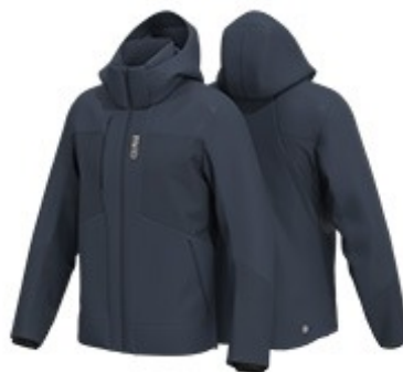
68 NAVY BLUE-NAVY BLUE