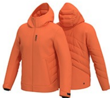
634 MARS ORANGE-MARS ORANGE