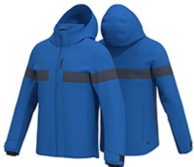
152 ABYSS BLUE-NAVY BLUE