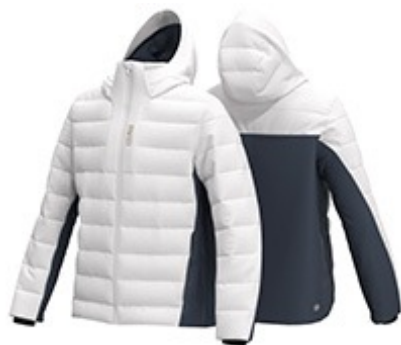
01 WHITE-NAVY BLUE