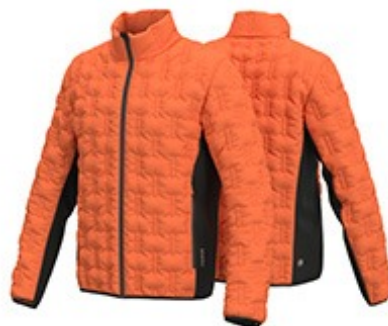
634 MARS ORANGE-BLACK