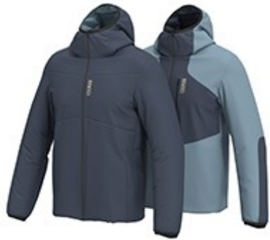
68 NAVY BLUE-AVION