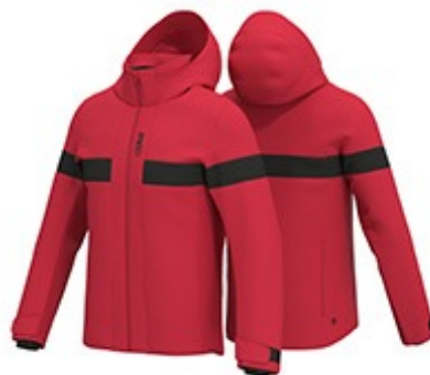
687 ENGLISH RED-BLACK