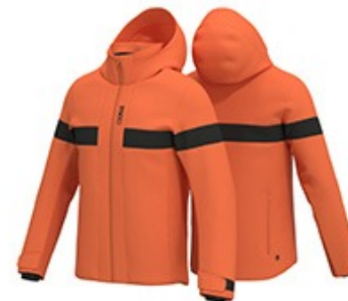
634 MARS ORANGE-BLACK