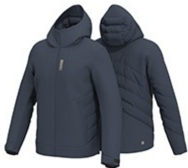
68 NAVY BLUE-NAVY BLUE