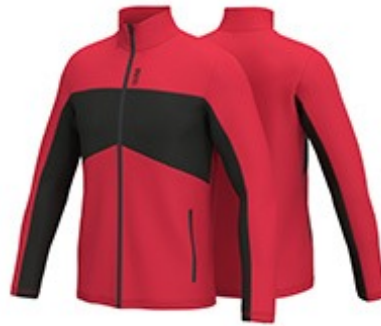
687 ENGLISH RED-BLACK