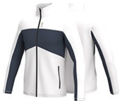
01 WHITE-NAVY BLUE