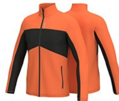
634 MARS ORANGE-BLACK