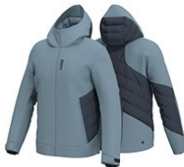
667 AVION-NAVY BLUE