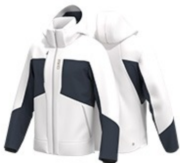
01 WHITE-NAVY BLUE