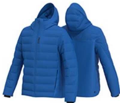
152 ABYSS BLUE-ABYSS BLUE