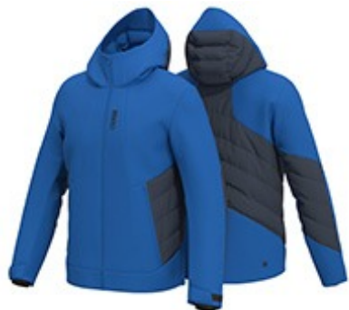
152 ABYSS BLUE-NAVY BLUE