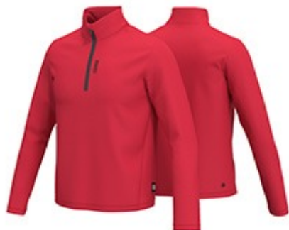
687 ENGLISH RED