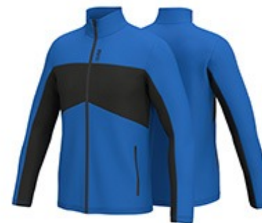
152 ABYSS BLUE-BLACK