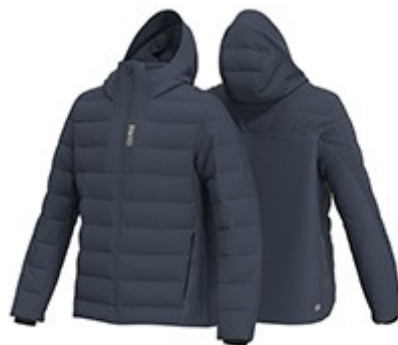
68 NAVY BLUE-NAVY BLUE